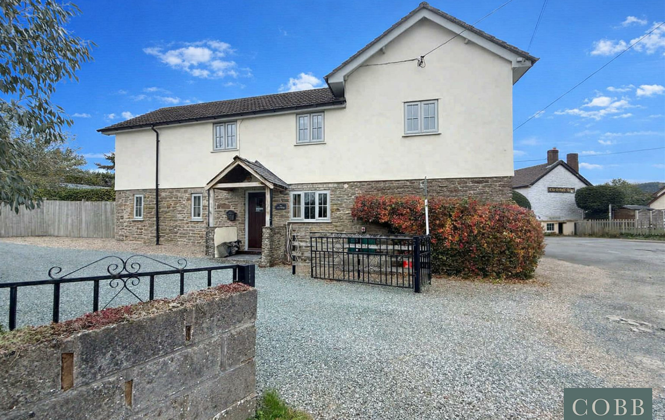
Ye Old Smithy, Bucknell, SY7 0AA Guide Price £390,000